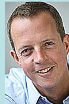
Nicholas Boles MP