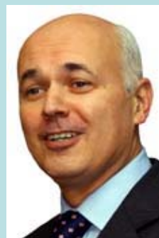
Iain Duncan Smith MP DWP