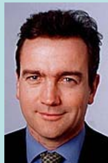
Nick Hurd MP Minister for Civic Society