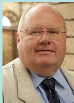
Eric Pickles MP CLG