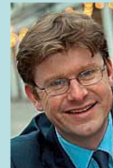
Greg Clark MP Localism Minister