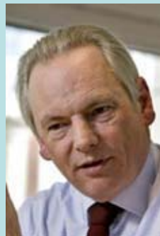
Francis Maude MP Cabinet Office