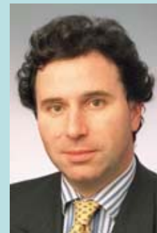
Oliver Letwin MP Cabinet Office