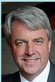
Andrew Lansley MP Health